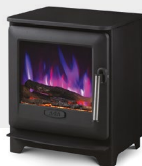
AGA Ludlow EC Range