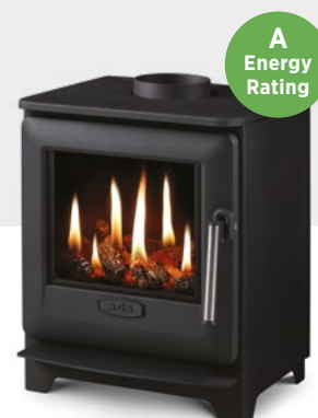
Ludlow EC Gas

Top and rear flue options available. For flue kits, contact 0845 644 2486 for full details.