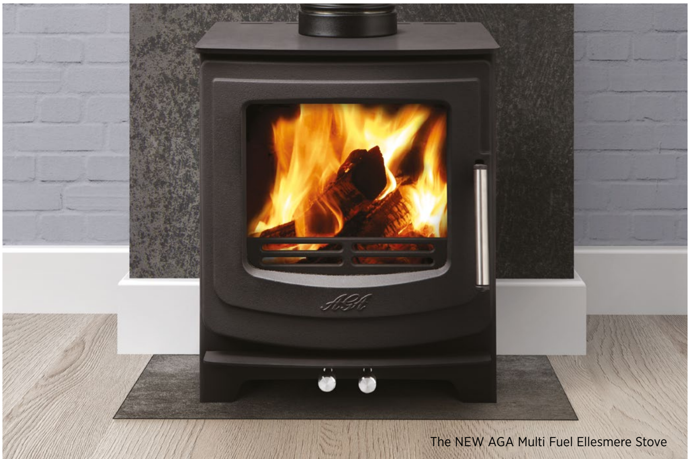
The NEW AGA Multi Fuel Ellesmere Stove