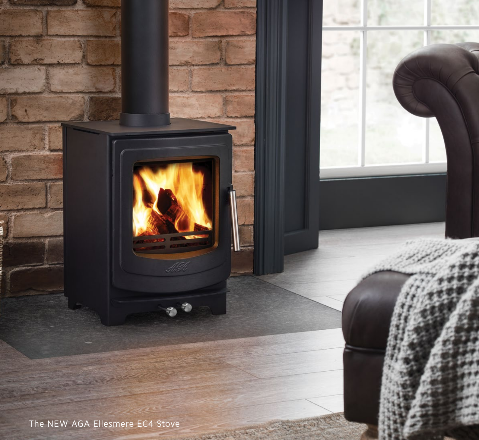
The NEW AGA Ellesmere EC4 Stove

FOR DETAILS OF YOUR LOCAL AGA STOVE DEALER CALL: