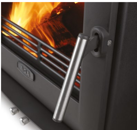
Modern look stainless steel furniture

Now available in all fuel types so whatever your need, the AGA Stoves range has the solution.