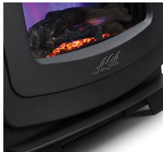
Beautiful design detail