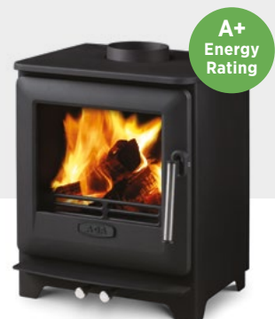
Ludlow EC Multi Fuel